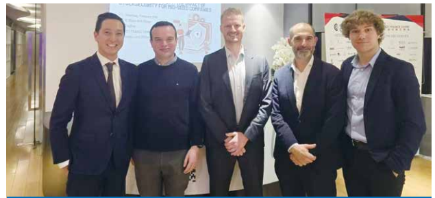
Conference Investing in Security: The Impact of Cybersecurity on SMEs - Shanghai