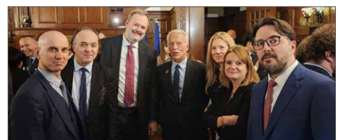
FORUM D'AFFAIRES FRANCO-CHINOIS