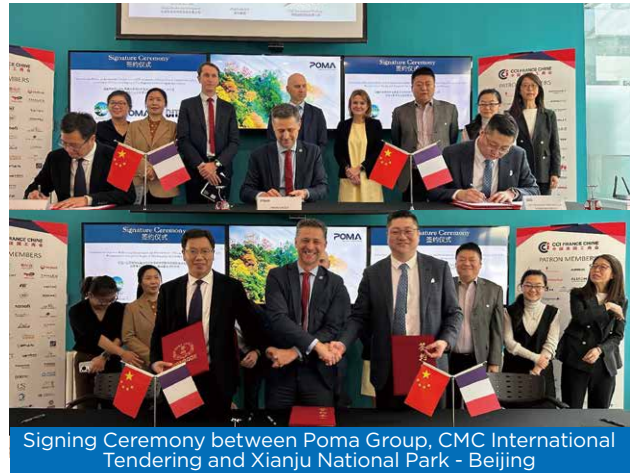
Signing Ceremony between Poma Group, CMC International Tendering and Xianju National Park - Beijing

CCI FRANCE CHINE Event Teams can help companies with the organization of business events in China.