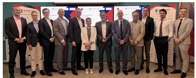
2025 Business Confidence Survey - Beijing