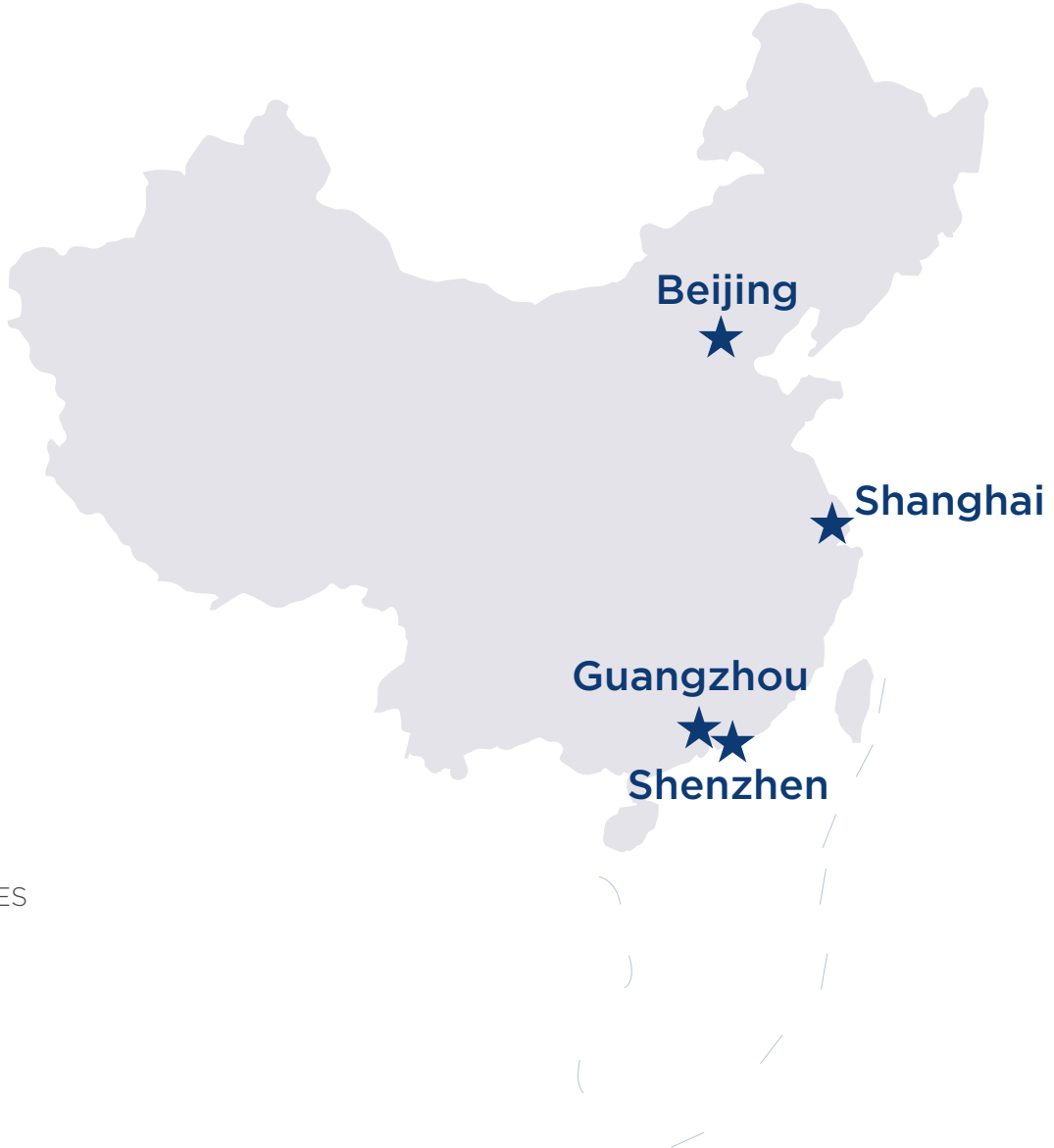
Distribution of members by region (2025)

CCI FRANCE CHINE is represented by 4 branches and representatives across China.