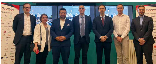
Conference: China's Space Activities - Beijing