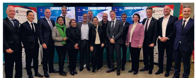
European Business in China Position Paper 2025/2026 - Beijing