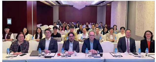
How Global ESG Certifications Enable the International Expansion of Chinese Companies - Guangzhou