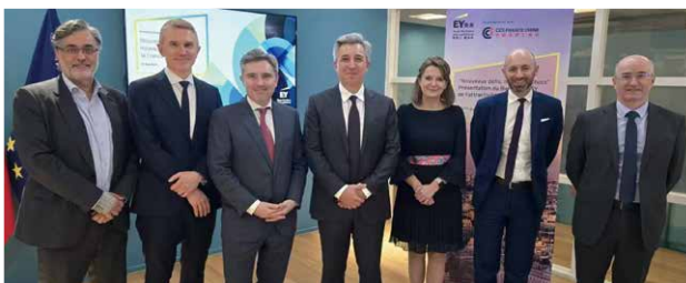
EY France Attractiveness Barometer - Shanghai