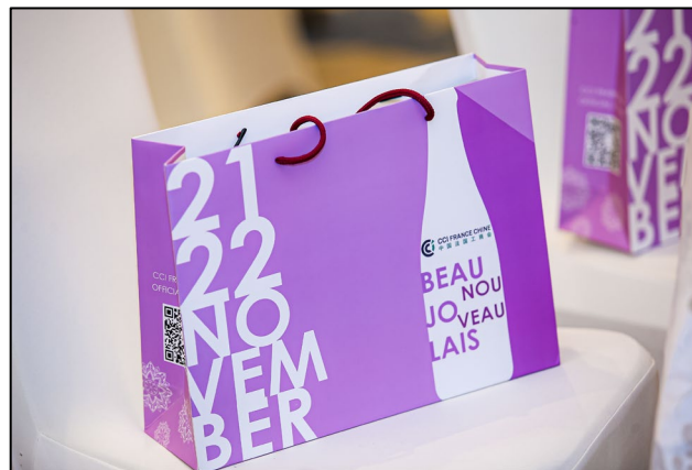
Gift-bag in 2019: